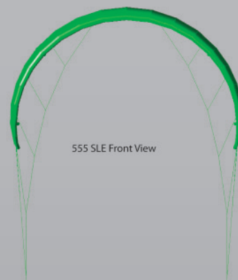
555 SLE Front View